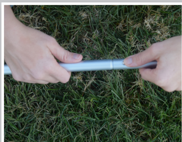
SNAP THE TWO TOP CENTER PIECES TOGETHER (PIECES THAT HAVE CORNERS)