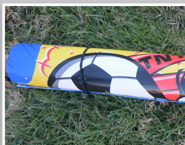
SAMPLE OF BANGEEES AROUND TUBE AS SHOWN