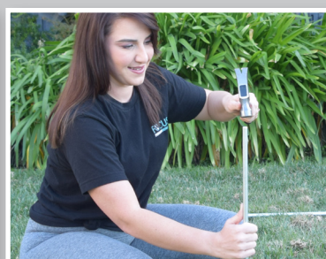
INSERT STAKES INTO GROUND