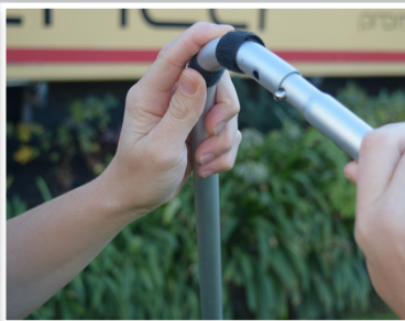
SNAP THE FIRST STRAIGHT PIECES AT THE BOTTOM OF EACH CORNER