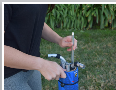
INSERT ALL COMPONENTS INTO TUBE AND PLACE INTO BAG