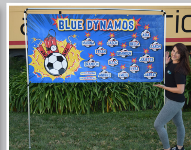
SLIDE SPORTS BANNER BUDDY OVER STAKES