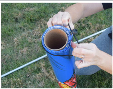
SECURE BANNER WITH BANGEE CORDS AROUND TUBE