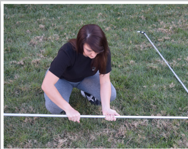
SNAP THE TWO STRAIGHT PIECES AT THE BOTTOM OF EACH SIDE