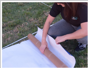
ROLL BANNER OVER TUBE