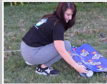
ROLL YOUR BANNER OUT BEFORE HANGING