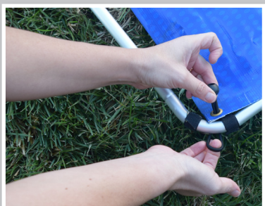
INSERT THE BUNGEE CORDS SUPPLIED AS SHOWN